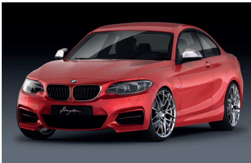
Breyton Fascinate on BMW M235i, rendered with KeyShot

For us, it's all about design and therefore it is extremely important that the renderings look realistic and are of high quality. The software must deliver excellent performance because we need to create renderings of entire cars. Another positive has been the fact we did not have to buy new hardware.